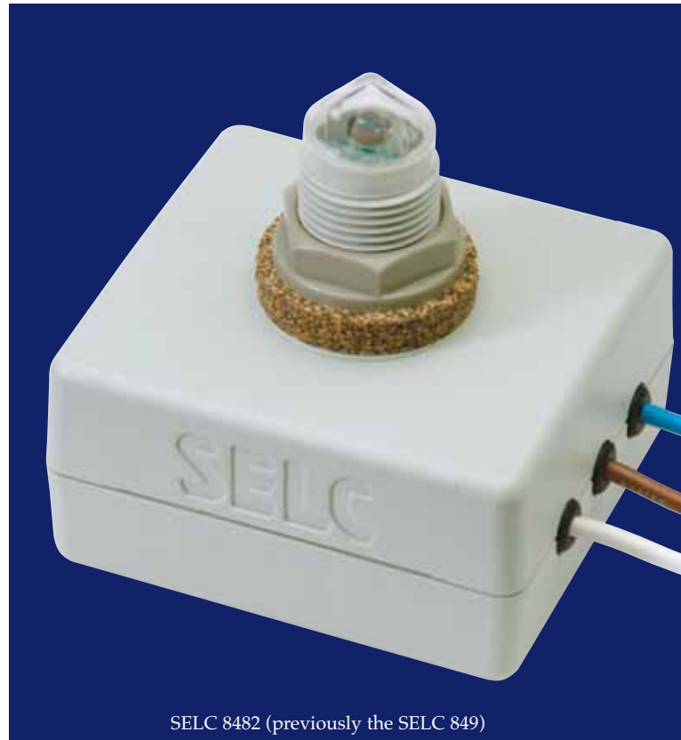
SELC 8482 (previously the SELC 849)