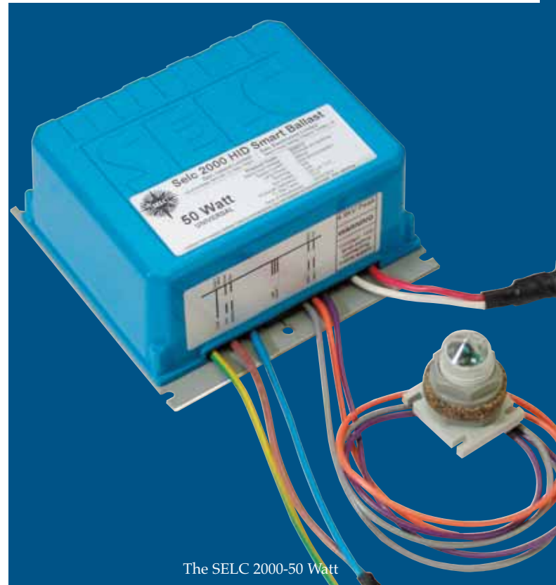
The SELC 2000-50 Watt